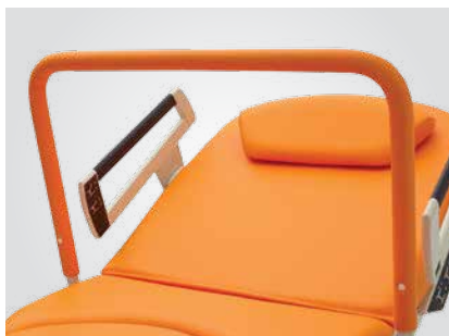
Supporting upholstered bar