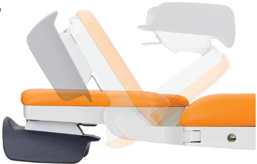
Quick adjustment of the leg rests into the required position.

The firm conception of leg rests enables the care team to respond very quickly and effectively to different situations which may occur during the delivery.