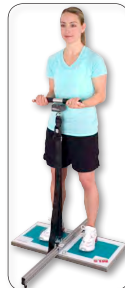
*Platform and Gauge sold separately.