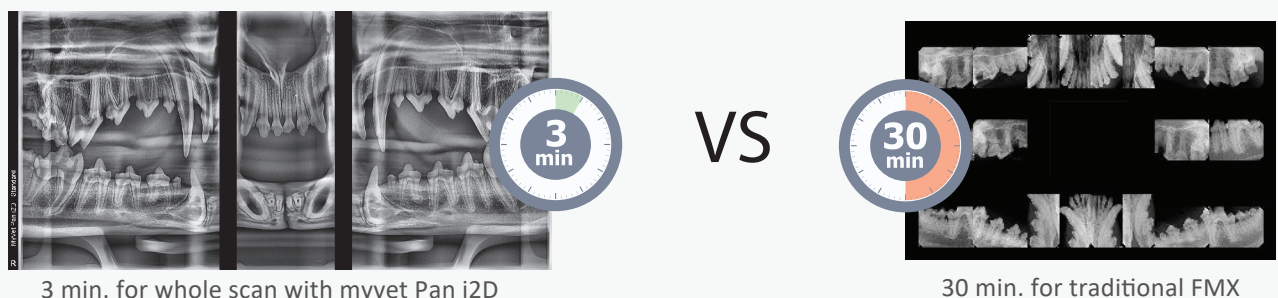
3 min. for whole scan with myvet Pan i2D

The procedure can be done within 3 minutes with mild sedation and it is over 7 times faster than traditional full mouth x-ray imaging procedure. Actual scan time is 15 seconds for full mouth. Panoramic images provide more coverage for bone defects and jaw lesions.